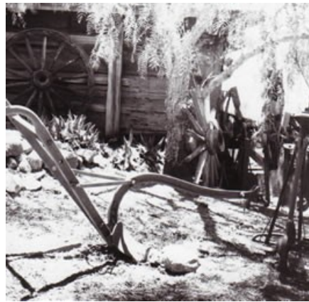
A Turning Plow at Sky Mesa Ranch