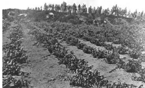
Zinfandel Grape Vineyard

As early as 1885, turkeys were raised here. The turkey ranches sold both eggs and meat. Chickens, sheep, hogs and cattle