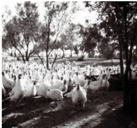
Prize White Birds Adams Turkey Ranch, Alpine Heights 1971