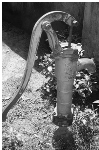
An old-fashioned hand water pump

The Alpine Historical Society is always in need of contributions to the archives and additions to the displays at the museum.